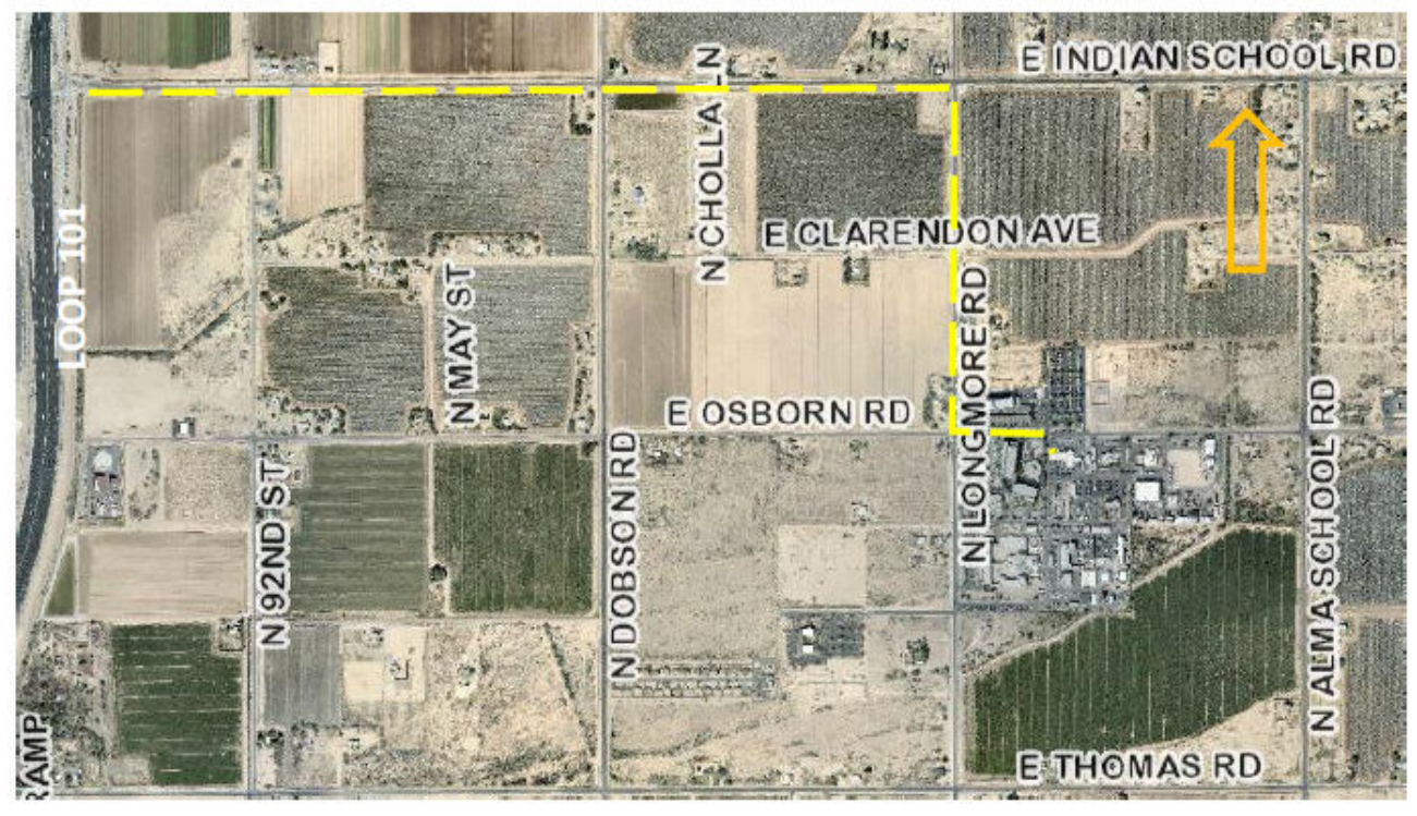
Map 1. Directions to the SRPMIC Two Waters Governmental Complex

The SRPMIC Finance Department and Community Development Department are located at the southeast corner of Osborn and Longmore Roads within the Two Waters Governmental Complex (see Map 1).